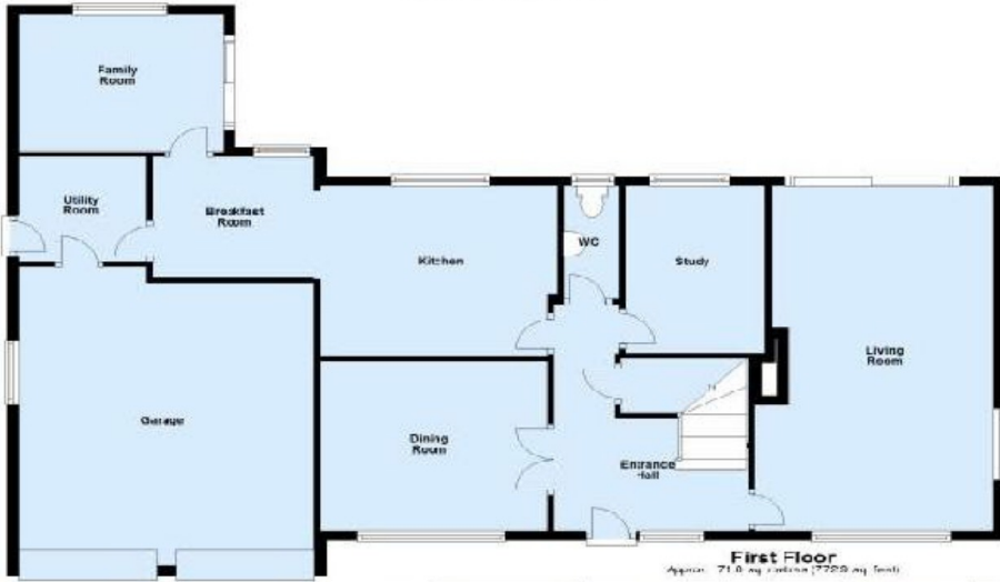
First Floor Approx. 71.0 sq. metres (759.9 sq. feet)