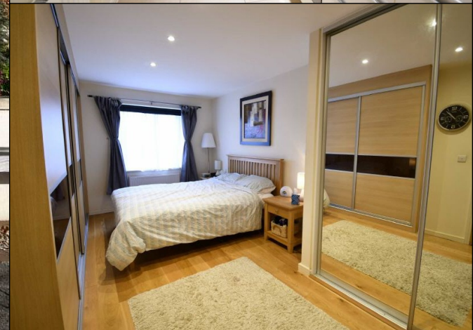
Corn House, Mill Hill, NW71EE £310,000