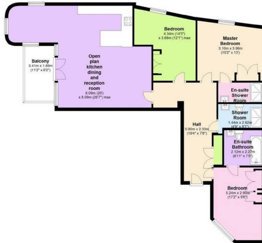
Total area: approx. 106.0 sq. metres (1141.4 sq. feet)

Measurements and features shown are approximate and for illustrative purposes only. Whilst we don't doubt the accuracy of this floor plan, no responsibility is taken for error or omission. If there is any aspect of importance you should carry out or commission your own inspection. Plan produced using PlanUp.