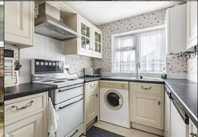
Ford House, New Barnet, EN5 5DY Guide price £255,000