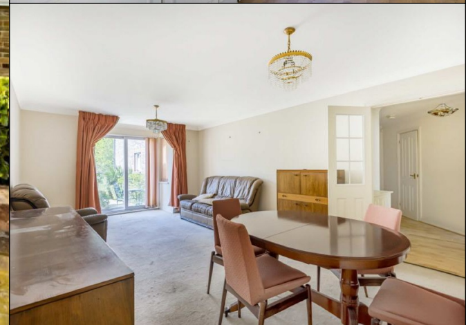
Odette Court, Whetstone, N20 0QB £475,000