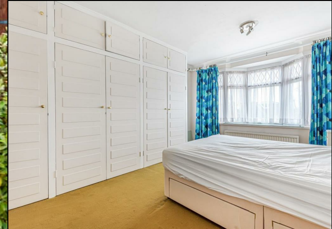
Greenway Close, Totteridge, N20 8EN Offers In Excess Of £1,000,000 Freehold