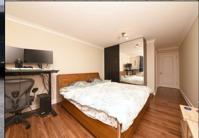
Willow Court, Woodside Park, N12 8TN Offers In Excess Of £650,000 Leasehold - Share of Freehold