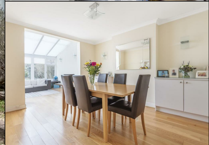
Nethercourt Avenue, West Finchley, N3 1PT £899,950 Freehold Council Tax Band F