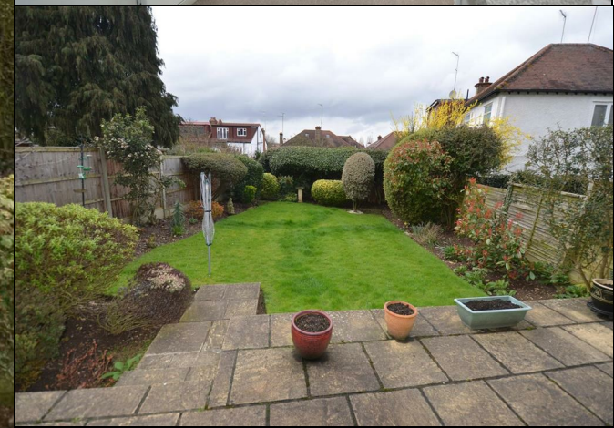
Courthouse Road, N12 7PH £799,950 Freehold